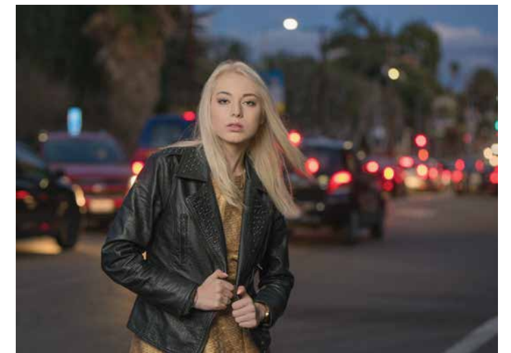
Focal length: 85mm Exposure: F/3.5 1/25sec

* Among 85mm F/1.8 interchangeable lenses for full-frame DSLR cameras as of January 2016. Data source: Tamron