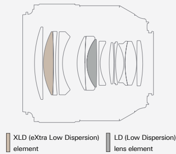
SP 85mm F/1.8 Di VC USD (Model F016)