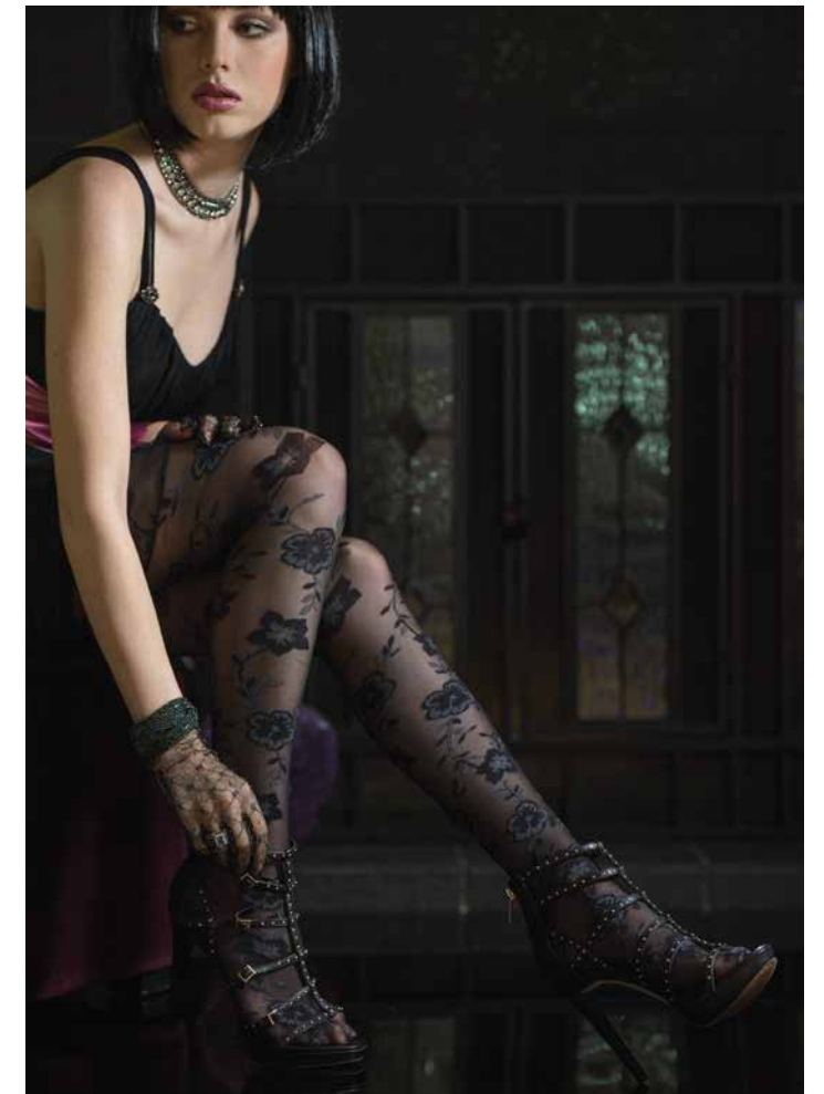
Focal length: 85mm Exposure: F/3.2 1/50sec

The SP 85mm F/1.8 is designed to provide tack-sharpness of the subject for stunning clarity and flawless image quality. At the same time, Tamron's design philosophy embraces the notion that photographers—particularly portrait photographers—use background blur, bokeh , as a creative element to concentrate emphasis on the subject. Through numerous simulations conducted for wide-ranging blur effects, such as a gentle, melting transition from the focused to the out-of-focus areas, Tamron has created a soft and natural blur effect that achieves perfect harmony with the inescapable sharpness.