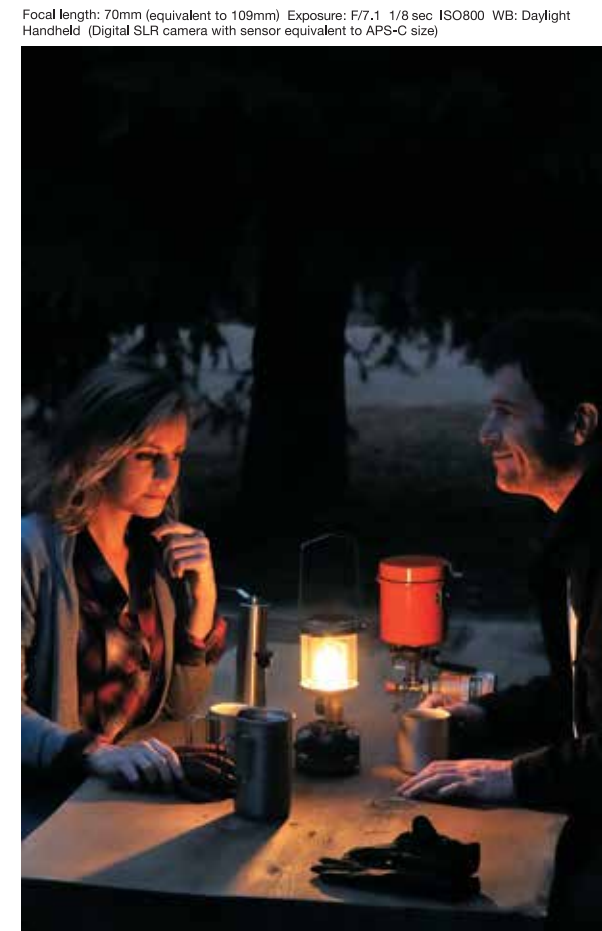
Focal length: 70mm (equivalent to 109mm) Exposure: F/7.1 1/8 sec ISO800 WB: Daylight Handheld (Digital SLR camera with sensor equivalent to APS-C size)

With an XLD lens element to deliver high resolution, image stabilization and a turbo speed silent autofocus, Tamron's new telephoto zoom makes it easy to capture the most difficult shots. Introducing the new SP 70-300mm F/4-5.6 Di VC USD.