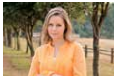
70mm (equivalent to 109mm)