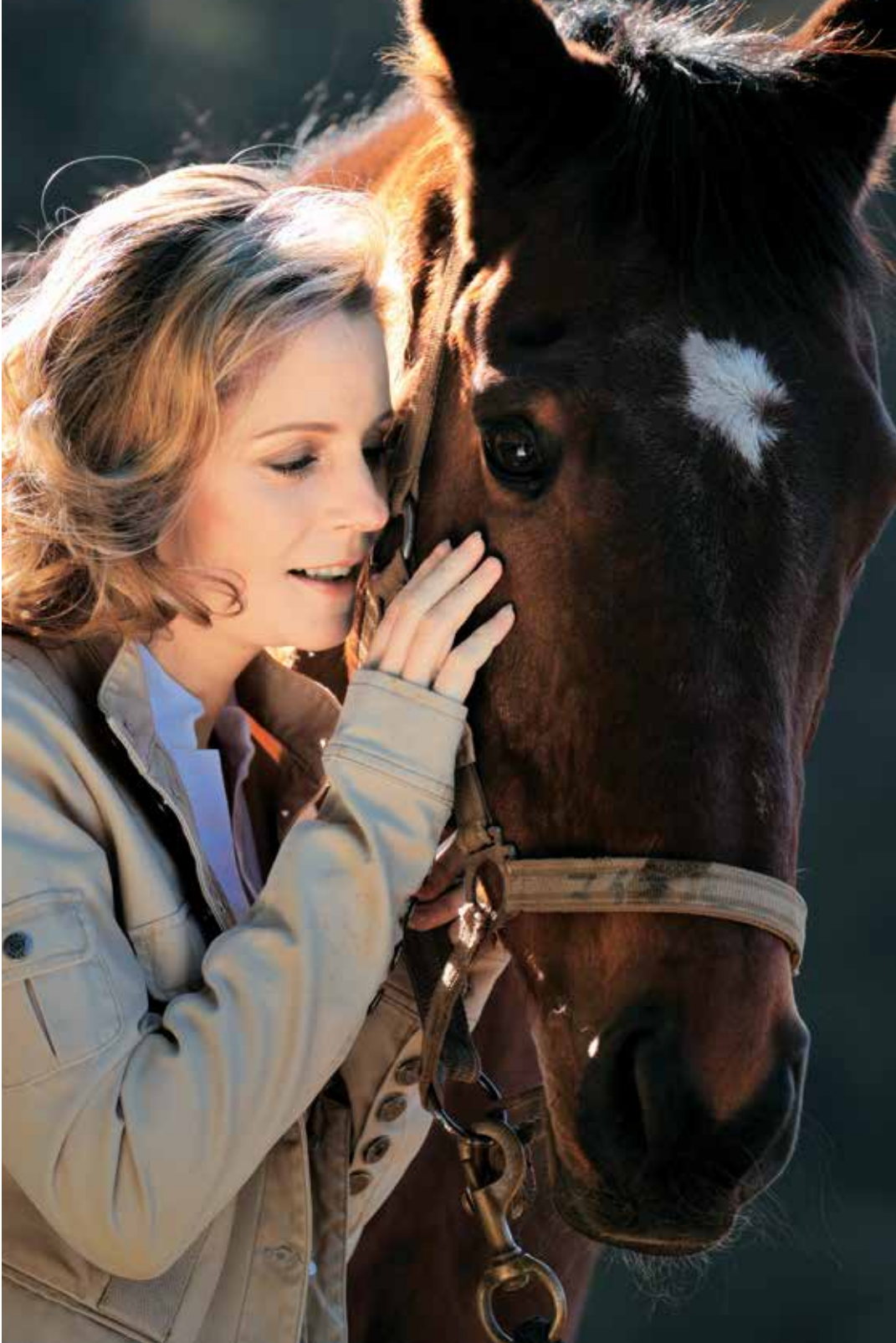
Focal length: 300mm Exposure: F/5.6 Aperture fully opened 1/200 sec ISO200 WB: Daylight Handheld