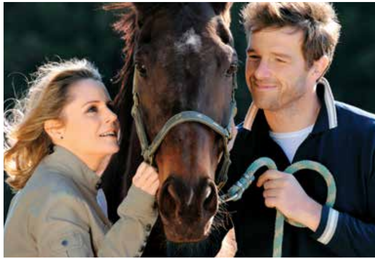
Focal length: 300mm Exposure: F/8 1/160 sec ISO400 WB: Daylight Handheld