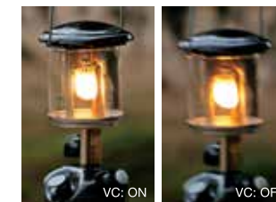
Focal length: 300mm Exposure: F/11 1/30 sec With VC, the photographer can shoot at a shutter speed up to four stops slower.

The new optical design of Tamron's advanced telephoto zoom lens delivers a whole new world of possibilities. It allows the photographer to draw the subject close and separate them from their background, creating photographs with spectacular contrast and depth. This lens also boasts Tamron's USD (Ultrasonic Silent Drive) and proprietary VC (Vibration Compensation) image stabilization. It gives the photographer the ability to capture fast moving subjects without blurring even in low light, and its new optical design that employs an XLD (Extra Low Dispersion) lens element made with highly specialized glass delivers crisp, clear images with sharp contrast.