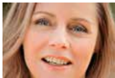
300mm (equivalent to 465mm)