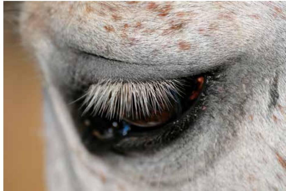
Focal length: 300mm (equivalent to 465mm) Exposure: F/5.6 Aperture fully opened 1/1000 sec ISO400 WB: Daylight Handheld (Digital SLR camera with sensor equivalent to APS-C size)