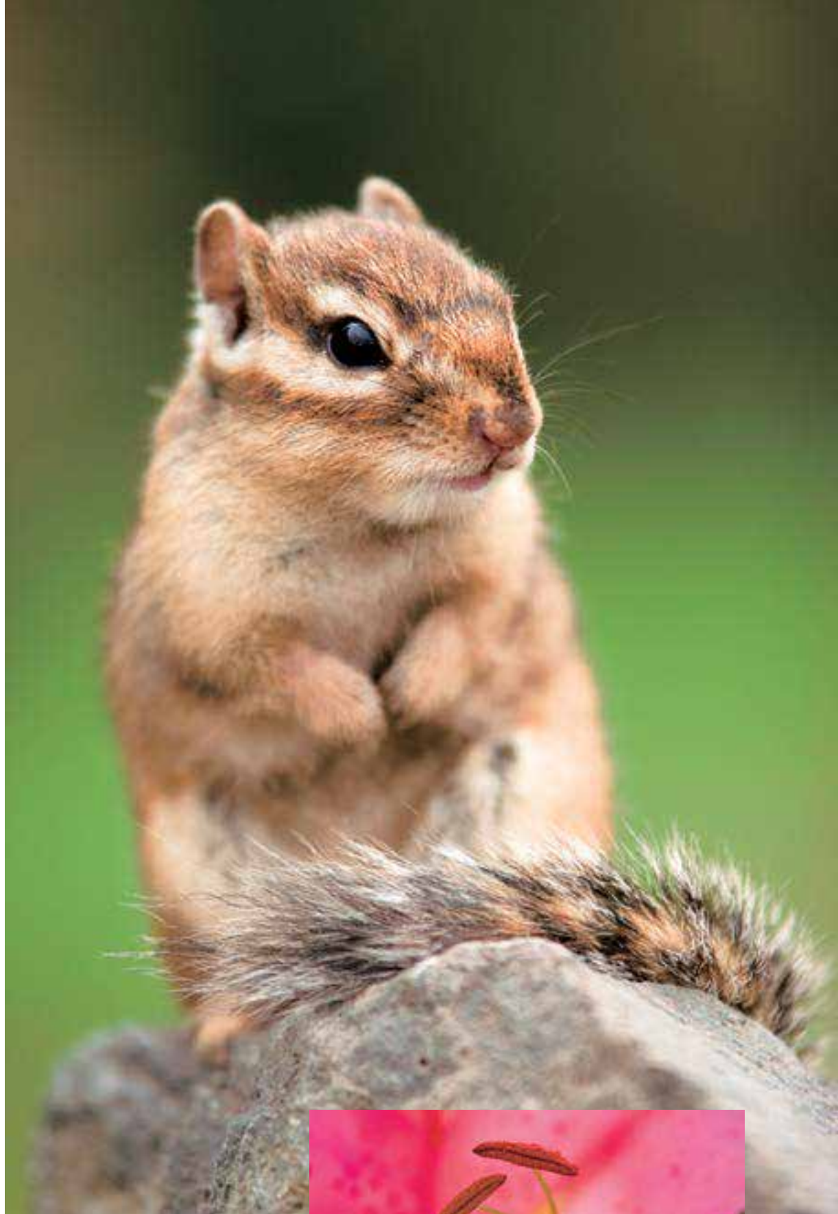
200mm (Equivalent to 310mm) Exposure : Aperture fully opened Auto ISO400 RAW (image taken with a digital SLR camera with an APS-C size sensor)