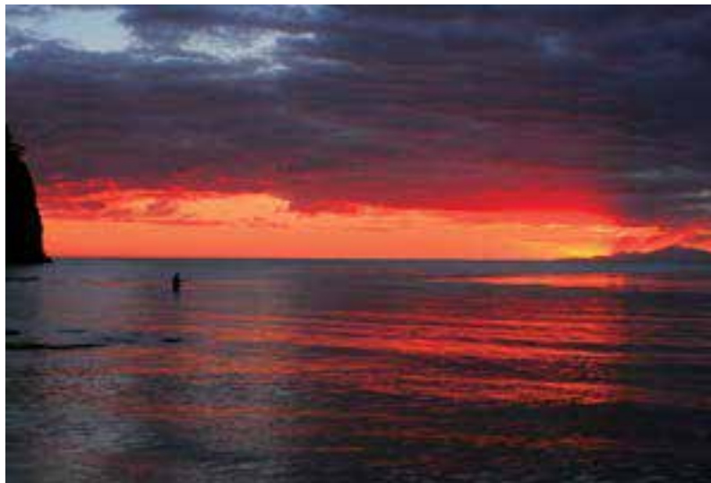
70mm 34'21" Exposure : F/11 Auto ISO100 RAW