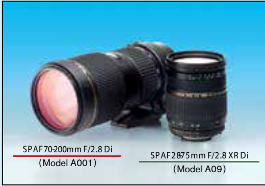
SP AF70-200mm F/2.8 Di (Model A001)