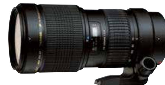
SP AF70-200mm F/2.8 Di LD [IF] MACRO